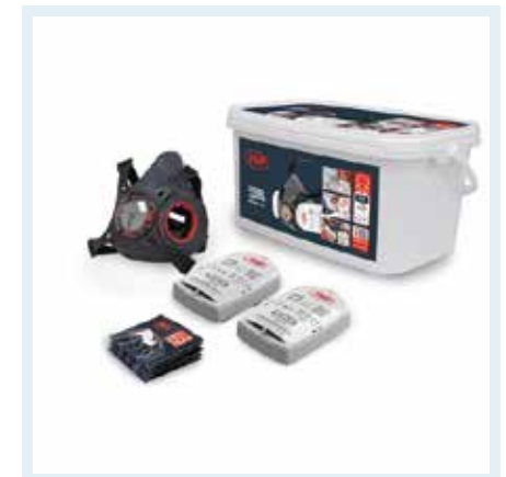
RESPIRATORY KITS AVAILABLE INCLUDE MASK, FILTERS, STORAGE CONTAINER AND CLEANING WIPES.