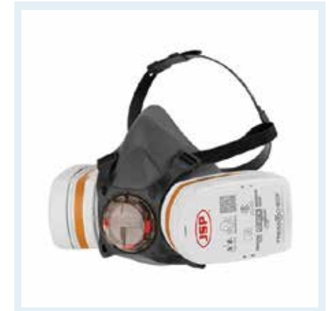
RESPIRATORY PACKS AVAILABLE INCLUDE MASK & FILTER

ABEK1P3 multi-gas/vapour + dust replacement filter Better protection in wet environments Resistance to clogging from very fine dust environments